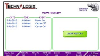
Screenshots off Touchscreen Interface